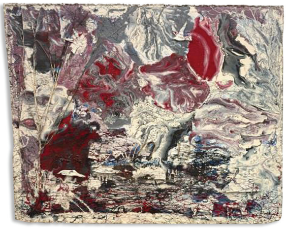
Ronald Lockett (American, 1965–1998), Poison River , 1988, wood, tin, nails, stones, industrial sealing compound, and enamel on wood, Collection of Souls Grown Deep Foundation. © Ronald Lockett.

As an extension, students can create Lockett-inspired paintings or found-object collages depicting their animals.