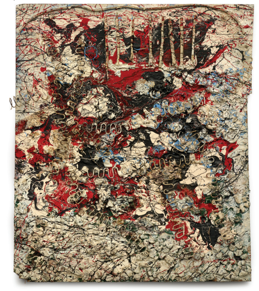
Ronald Lockett (American, 1965–1998), Civil Rights Marchers, 1988, wood, metal, rubber, industrial sealing compound, and paint on wood, Collection of Souls Grown Deep Foundation. Photograph by Stephen Pitken/Pitken Studio. © Ronald Lockett.

Have students view and analyze Poison River. What reflects pollution or damage to the environment? How might a painting of a landscape unaffected by pollution look different?