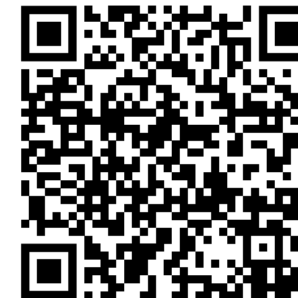
General Map QR Code