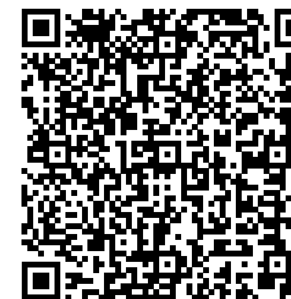
Sensory Map QR Code

The museum is made up of three buildings. You can access a digital museum map and a digital sensory map using these QR codes.