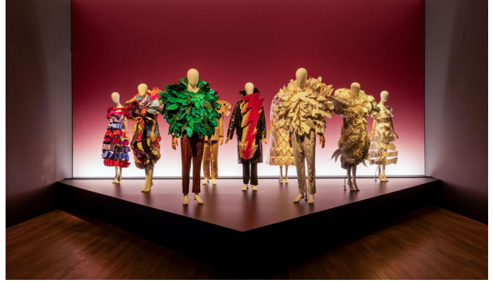
Viktor&Rolf. Fashion Statements