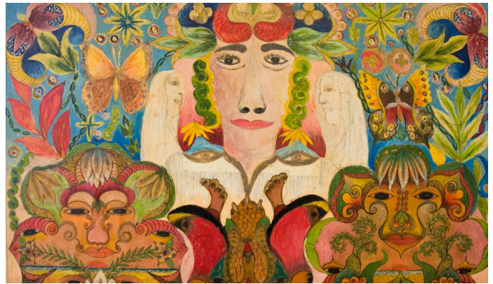
The Lost World: The Art of Minnie Evans