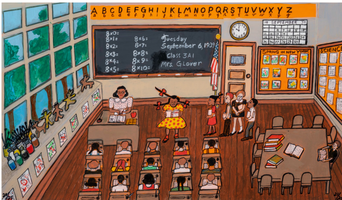
Faith Ringgold: Seeing Children