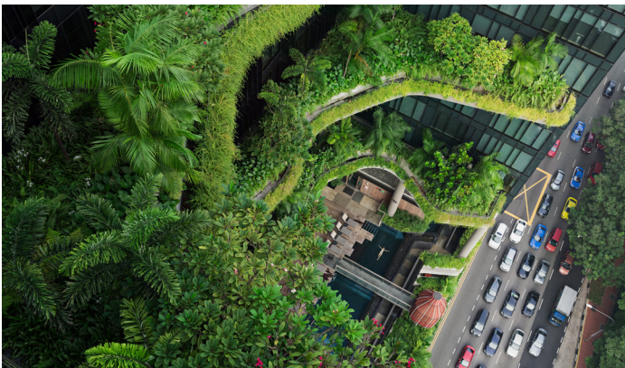
Photography's New Vision: Experiments in Seeing